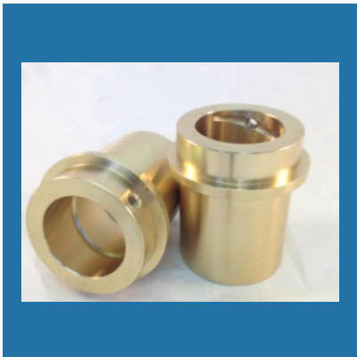
Aluminum Bronze Parts