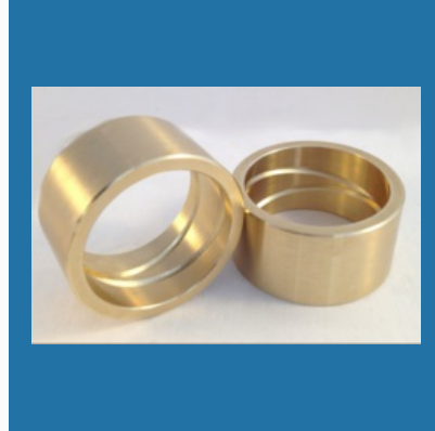
Phosphor Bronze Bushes