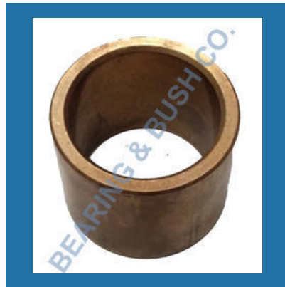
Sintered Bronze Bearing