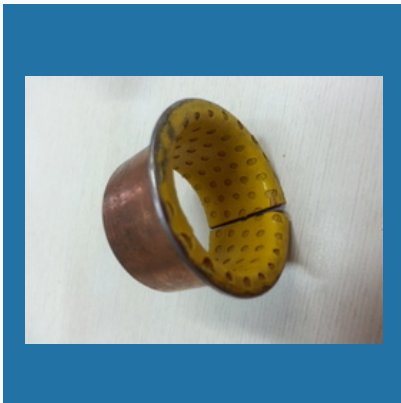
DX Type FDX Bushes