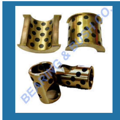
High Tensile Manganese Bronze Bushes