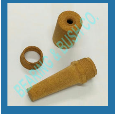
Sintered Bronze Filter