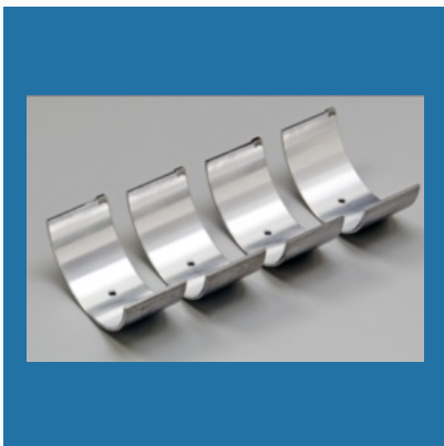
Steel Backed White Metal Bearings