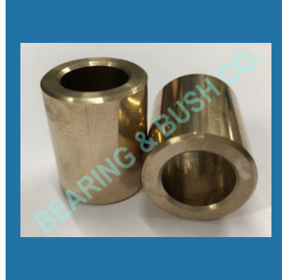
Gunmetal Bronze Bushes