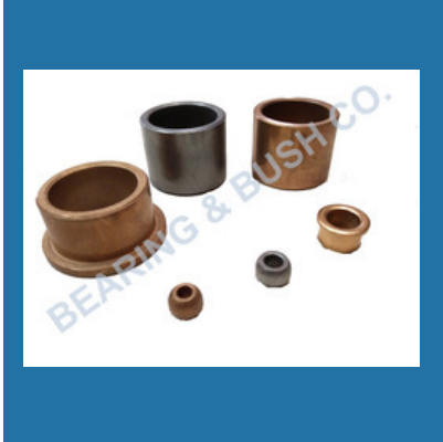
Sintered Bushes & Parts