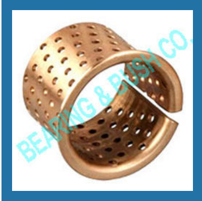
Homogeneous Bronze (Cu 91,3%, Sn 8,5%, P 0,2%)