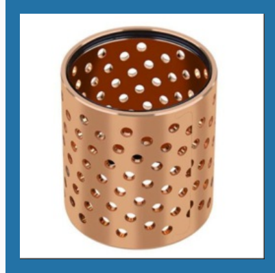
Brass Hot Rolled Sheet