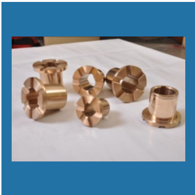
Gun Metal Bushes for Automotive Industry