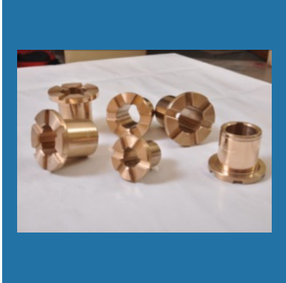
Casted Gunmetal Bushes