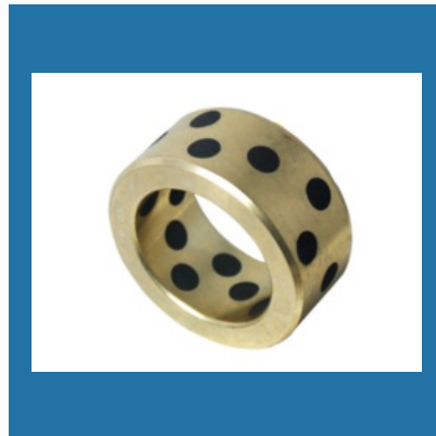
Graphite Bronze Bushes