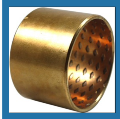
Steel Backed BI Metal Bearings