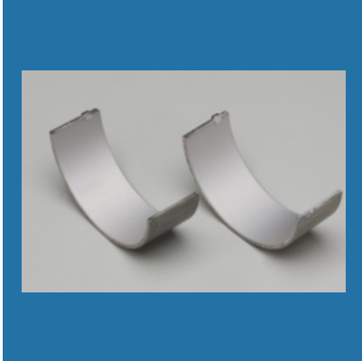
Steel Backed Tri Metal Bearings