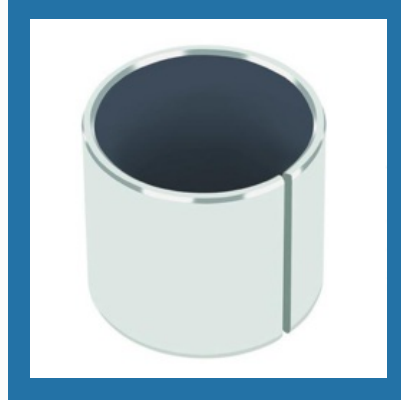
DU Type MDU Bushes